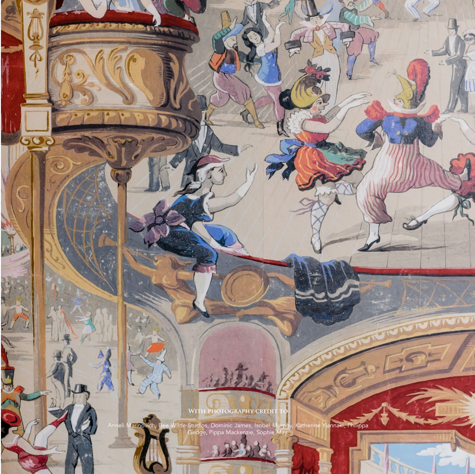
WITH PHOTOGRAPHY CREDIT TO